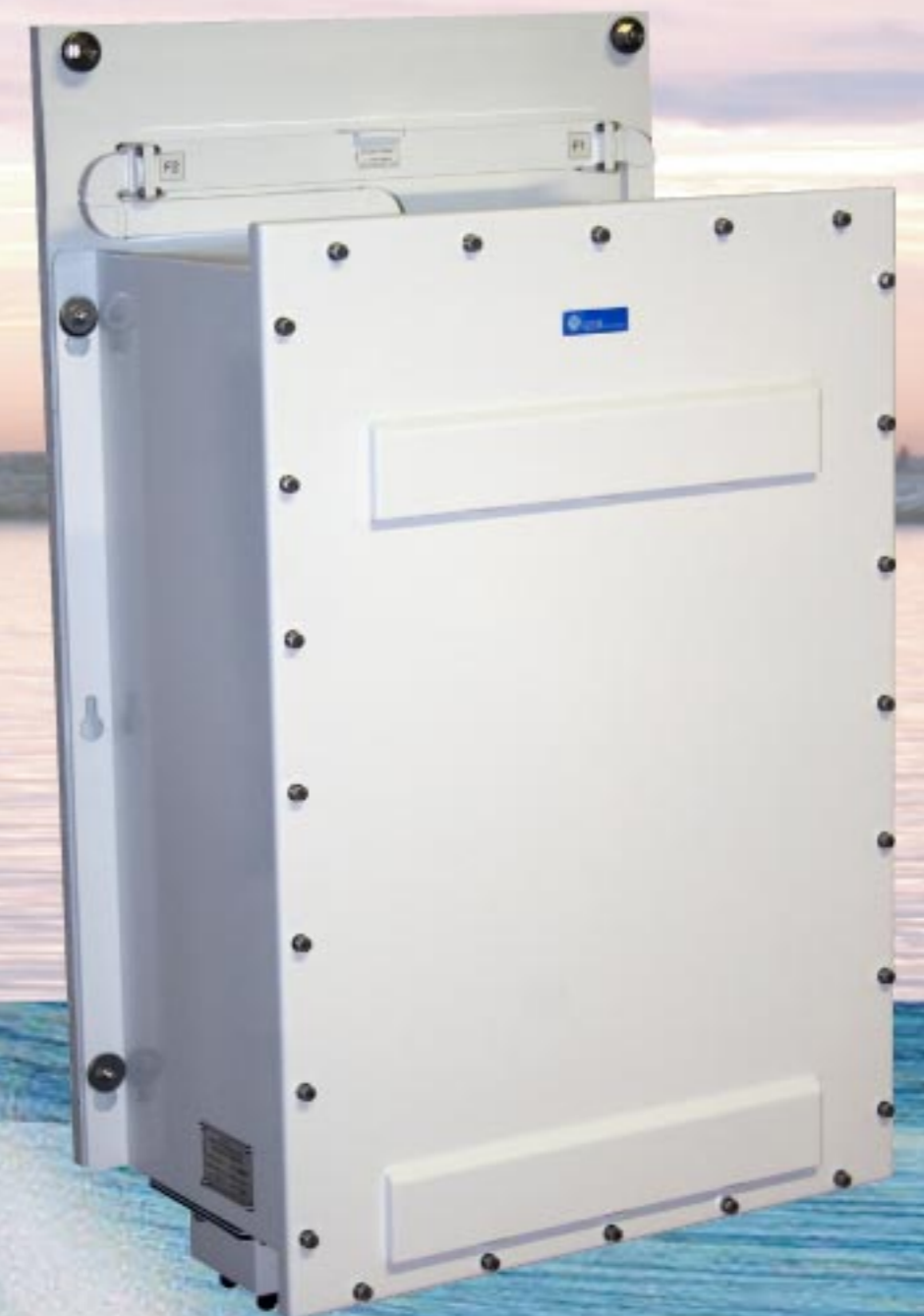
X-Band 12 - 19 feets and S-Band 21 feets ARRAY