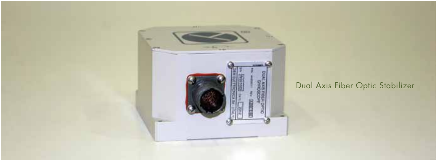
Dual Axis Fiber Optic Stabilizer